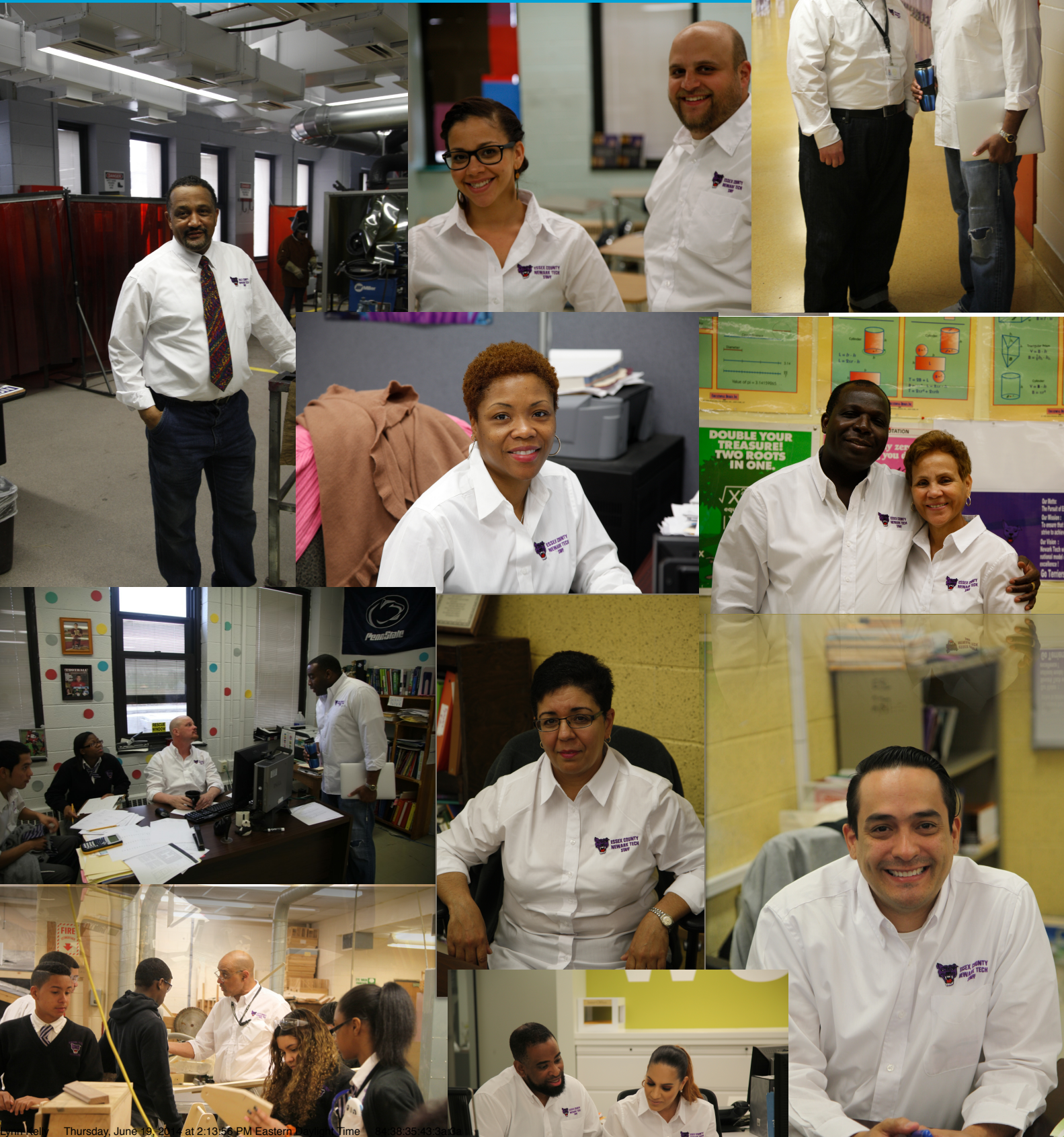
Teachers were rewarded with new tailored white shirts and matching briefcases inscribed with their names.